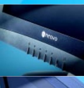
Elegant & Rugged Design

Made for those who want an excellent value display